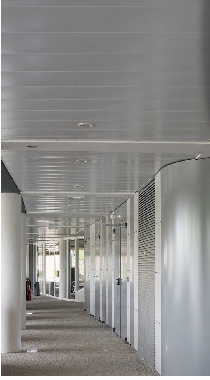
© Parking lot - An idea of Soret Defrance Architectes, designed and produced by SAT Manager