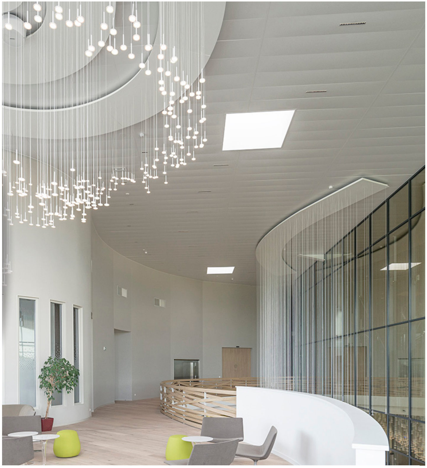
© Reception - An idea of Soret Defrance Architectes, designed and produced by SAT Manager