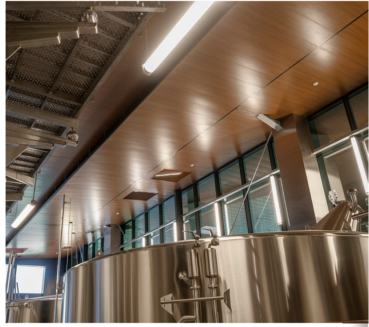
© Vat room - An idea of Soret Defrance Architectes, designed and produced by SAT Manager